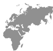
Europe Middle East Africa