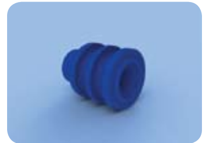
Single Wire Seal