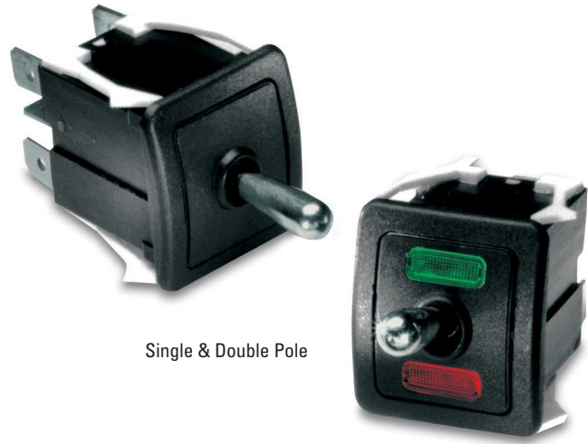
Single & Double Pole

A choice of models are offered to handle current from 16 amps to low level electronic switching levels.