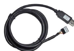
4D Programming Cable

Using a non-4D programming interface could damage your processor, and void your Warranty.