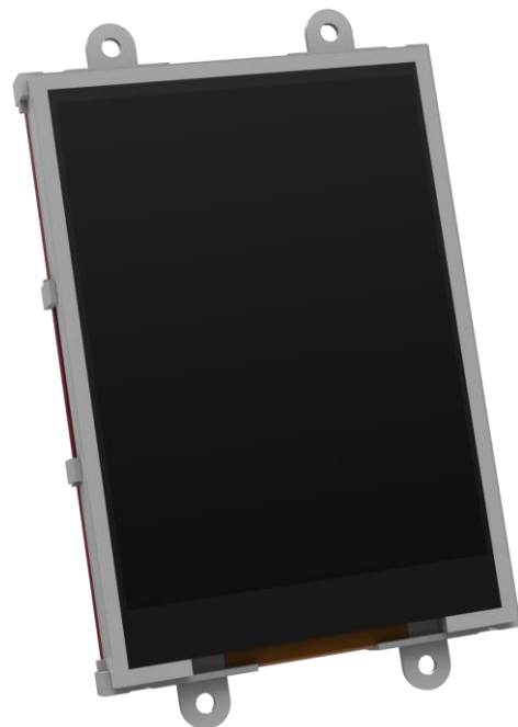
The uLCD-32-PTU Display Module