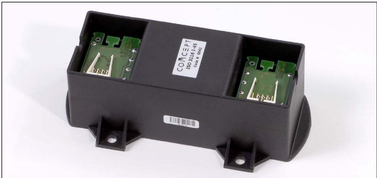
Fig. 1 Power Supply ISO3116I

For drivers adapted to various types of high-power and high-voltage IGBT modules, refer to www.IGBT-Driver.com/go/plug-and-play