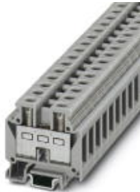
Feed-through modular terminal block, Connection method: Screw connection, Cross section: 0.5 mm 2 - 10 mm 2 , AWG 20 - 8, Width: 8.2 mm, Color: gray, Mounting type: NS 15

Please be informed that the data shown in this PDF Document is generated from our Online Catalog. Please find the complete data in the user's documentation. Our General Terms of Use for Downloads are valid ( http://download.phoenixcontact.com )