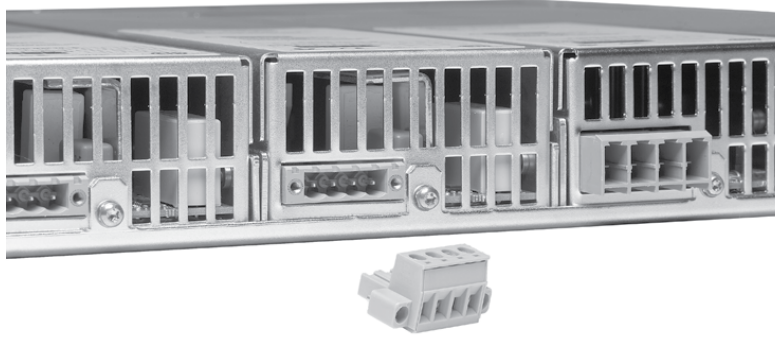
Figure 5. Quick disconnects for power and sense leads