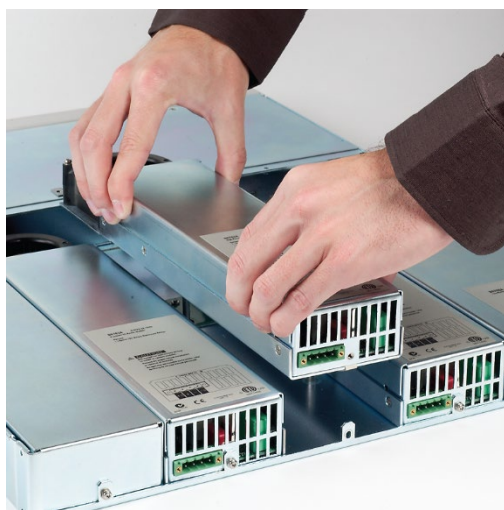
Figure 6c. User re-configurable modular system

For details on these products and how they can be used for specific applications visit www.keysight.com/find/N6783A-BAT , www.keysight.com/find/N6783A-MFG and download the N6783A-BAT Data Sheet , 5990-8662EN and the N6783A-MFG Data Sheet , 5990-8643EN.