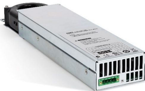
Figure 6b. The basic series

The Keysight N6730, N6740 and N6770 Series of DC power modules provide programmable voltage and current, measurement and protection features at a very economical price, making these modules suitable to power the DUT or to provide power for ATE system resources, such as fixture control.