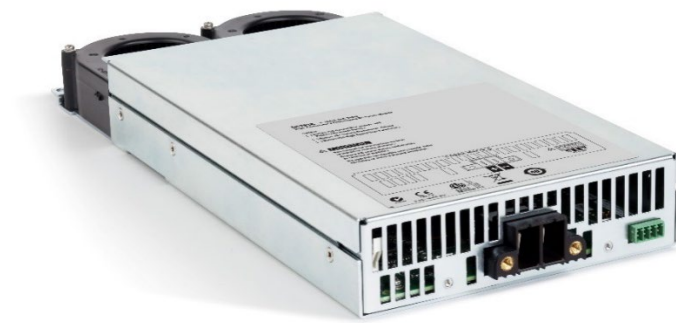
Figure 6c The N6753A – N6756A High performance and the N6763A – N6766A Precision DC power modules each occupy two module slots within the mainframe. All other modules occupy 1 module slot.

For details on these products and how they can be used for applications including battery drain analysis and function test, visit www.keysight.com/find/N6780 and download the N6780 Series Source/Measure Units (SMUs) for the N6700 Modular Power System Data Sheet , literature number 5990-5829EN