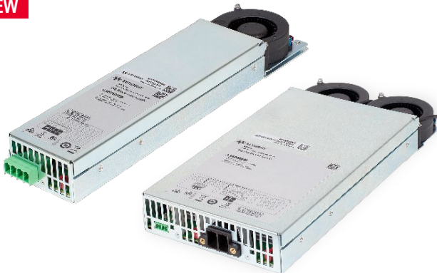
Figure 6a. The Electronic Load Series