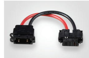
MULTI-BEAM XLE Panel Mount to Squeeze Release