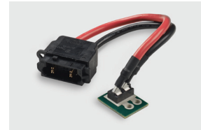
MULTI-BEAM XLE Panel Mount to Press-Fit