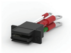
50A Cable Assembly