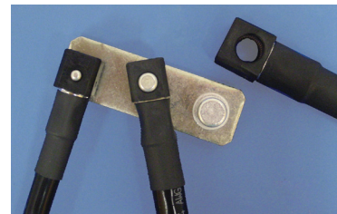
RAPID LOCK Bus Bar Connectors