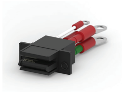
50A Cable Assembly