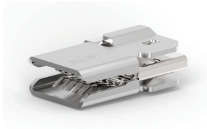
150A Bus Bar Connector