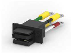
25A Cable Assembly