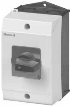
for wall installation

Third-party accessories from Möller Electric GmbH