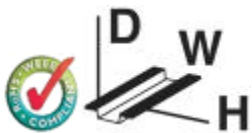
Figure shows PLC-BSC-120UC/21-21/SO46 version

14 mm PLC basic terminal block with screw connection, without relay or solid-state relay, for mounting on DIN rail NS 35/7,5, 2 PDTs, input voltage 24 V AC/DC