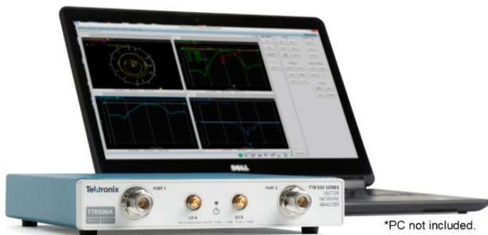
*PC not included.

An independent RF source and three RF receivers for each port of the TTR500 enable you to take high-accuracy magnitude and phase measurements with a 1-port or 2-port device under test (DUT). Use the TTR500 to perform complete S_{11} , S_{12} , S_{21} , and S_{22} measurements of the DUT and display data in a variety of formats (see measurement functionality table).