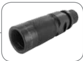
Plug with metallic band backshell

Part number: UCOM-10G+ PT x x B x: see the 'How to order' below to complete your part number