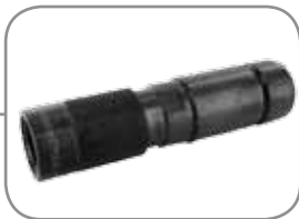
Plug with cable gland backshell

Part number: UCOM-10G+ PT x x G x x: see the 'How to order' below to complete your part number