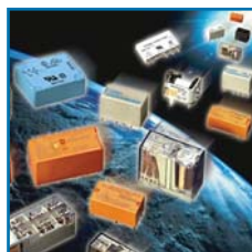
Schrack PCB Relays