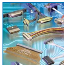
Microdot Connectors and Cables