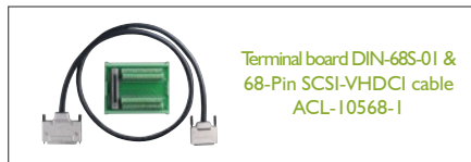
Terminal board DIN-68S-01 & 68-Pin SCSI-VHDCI cable ACL-10568-I