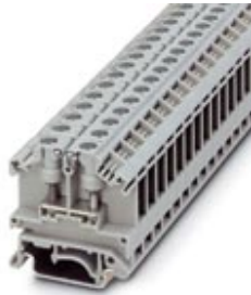
Universal terminal block with bolt connection, cross section: 0.1 - 2.5 mm 2 , width: 9 mm, color: Gray

Please be informed that the data shown in this PDF Document is generated from our Online Catalog. Please find the complete data in the user's documentation. Our General Terms of Use for Downloads are valid ( http://download.phoenixcontact.com )