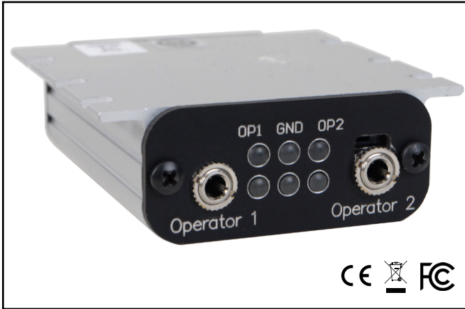
Figure 1. SCS CTC337 Wrist Strap and Ground Monitor