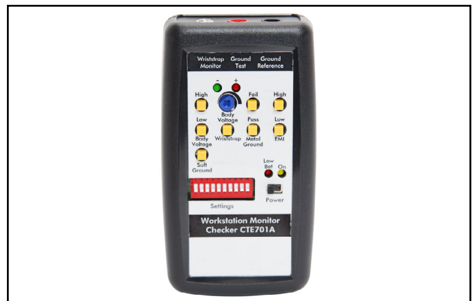
Figure 3. SCS CTE701 Workstation Monitor Checker

The checker verifies the proper operation of dual wrist strap monitoring. Connect a 3.5 mm test cable to both the checker and to the operator jack of the monitor. At this point the monitor should indicate failure. Depress the Pass button on the wrist strap section. The monitor should indicate a good connection. While pressing the Pass button, press body voltage “high.” At this point the Wrist Strap LED would be blinking red.