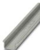
DIN rail, material: Steel, unperforated, 2.3 mm thick, height 15 mm, width 35 mm, length: 2 m

DIN rail - NS 35/15-2,3 UNPERF 2000MM - 1201798