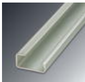
G rail 32 mm (NS 32)

DIN rail - NS 32 AL UNPERF 2000MM - 1201028