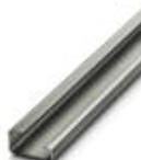
G-profile DIN rail, material: Steel, unperforated, height 15 mm, width 32 mm, length 2 m

DIN rail - NS 32 UNPERF 2000MM - 1201015