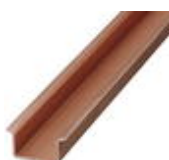
DIN rail, material: Copper, unperforated, 1.5 mm thick, height 15 mm, width 35 mm, length: 2 m

DIN rail - NS 35/15 CU UNPERF 2000MM - 1201895