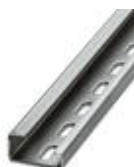
G-profile DIN rail, material: Steel, perforated, height 15 mm, width 32 mm, length 2 m

DIN rail - NS 35/15 CU UNPERF 2000MM - 1201895