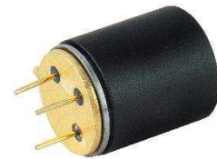
Isolating Cover Option