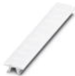
Zack marker strip, Strip, white, Labeled according to customer specifications, Mounting type: Snap into tall marker groove, For terminal block width: 6.2 mm, Lettering field: 6.15 x 10.5 mm