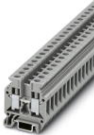
Feed-through terminal block, Connection method: Screw connection, Cross section: 0.2 mm 2 - 6 mm 2 , AWG 24 - 10, Width: 6.2 mm, Color: gray, Mounting type: NS 15

Please be informed that the data shown in this PDF Document is generated from our Online Catalog. Please find the complete data in the user's documentation. Our General Terms of Use for Downloads are valid ( http://download.phoenixcontact.com )