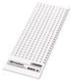
Marker cards, Card, white, Unlabeled, Can be labeled with: Plotter, Mounting type: Snap into tall marker groove, Snap into flat marker groove, For terminal block width: 6.2 mm, Lettering field: 6 x 6.1 mm

Marker cards - SBS 6:UNBEDRUCKT - 1007222