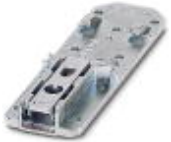
Universal DIN rail adapter