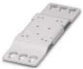
Universal wall adapter