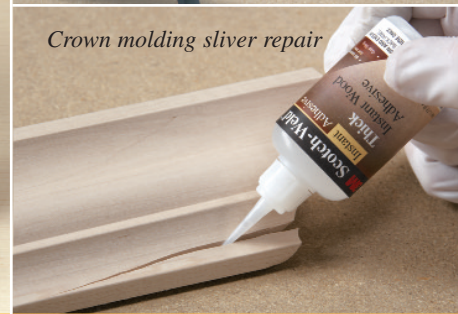
Crown molding sliver repair