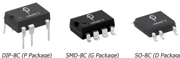
Figure 2. Package Options.