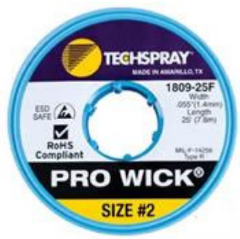
1810-25F Pro Wick Green #3 Braid - AS 25' 1 units/case