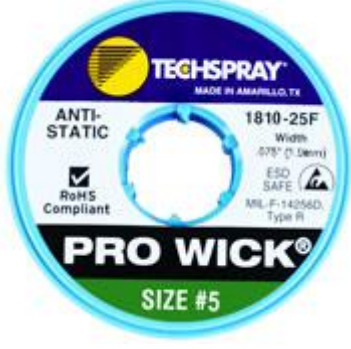
1811-10F Pro Wick Blue #4 Braid - AS 10' 25 units/case