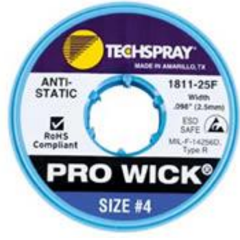
1813-5F Pro Wick Red #6 Braid - AS 5' 25 units/case