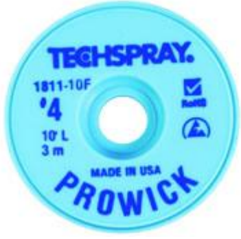
1812-5F Pro Wick Brown #5 Braid - AS 5' 25 units/case