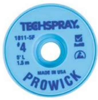
1811-100F Pro Wick Blue #4 Braid - AS 100' 1 units/case