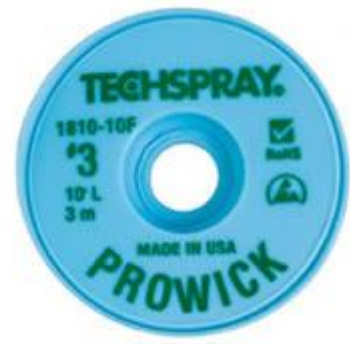
1811-5F Pro Wick Blue #4 Braid - AS 5' 25 units/case