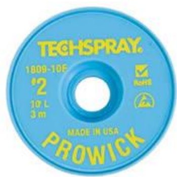
1810-10F Pro Wick Green #3 Braid - AS 10' 25 units/case