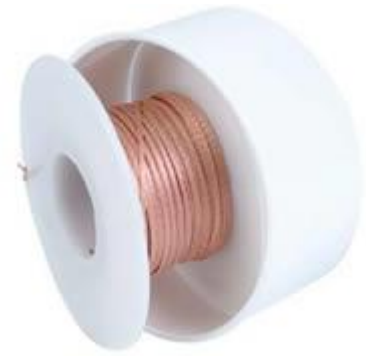
1811-25F Pro Wick Blue #4 Braid - AS 25' 1 units/case