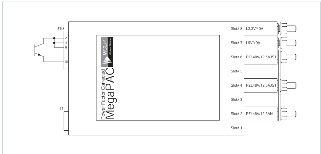
Figure 6 Enable / disable control of Maxi Arrays

Note: For single output power supply configurations, the simplest method of remotely enabling and disabling the output is to use the General Shutdown (GSD) function.