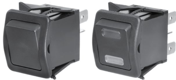
K2 Series Single & Double Pole