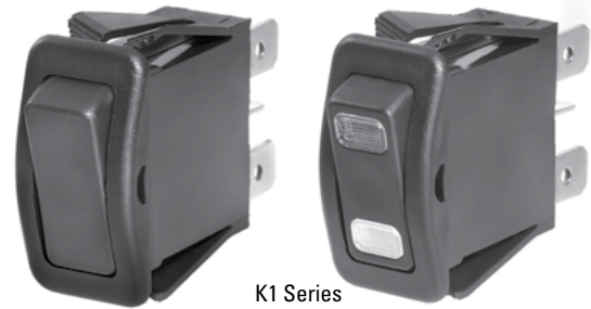
K1 Series Single Pole

OTTO can provide custom colors upon request. Value-added assemblies with wire leads are also available. Please consult the factory for assistance.