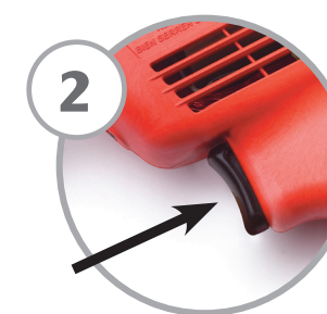
Trigger pulled all the way: 100 W power