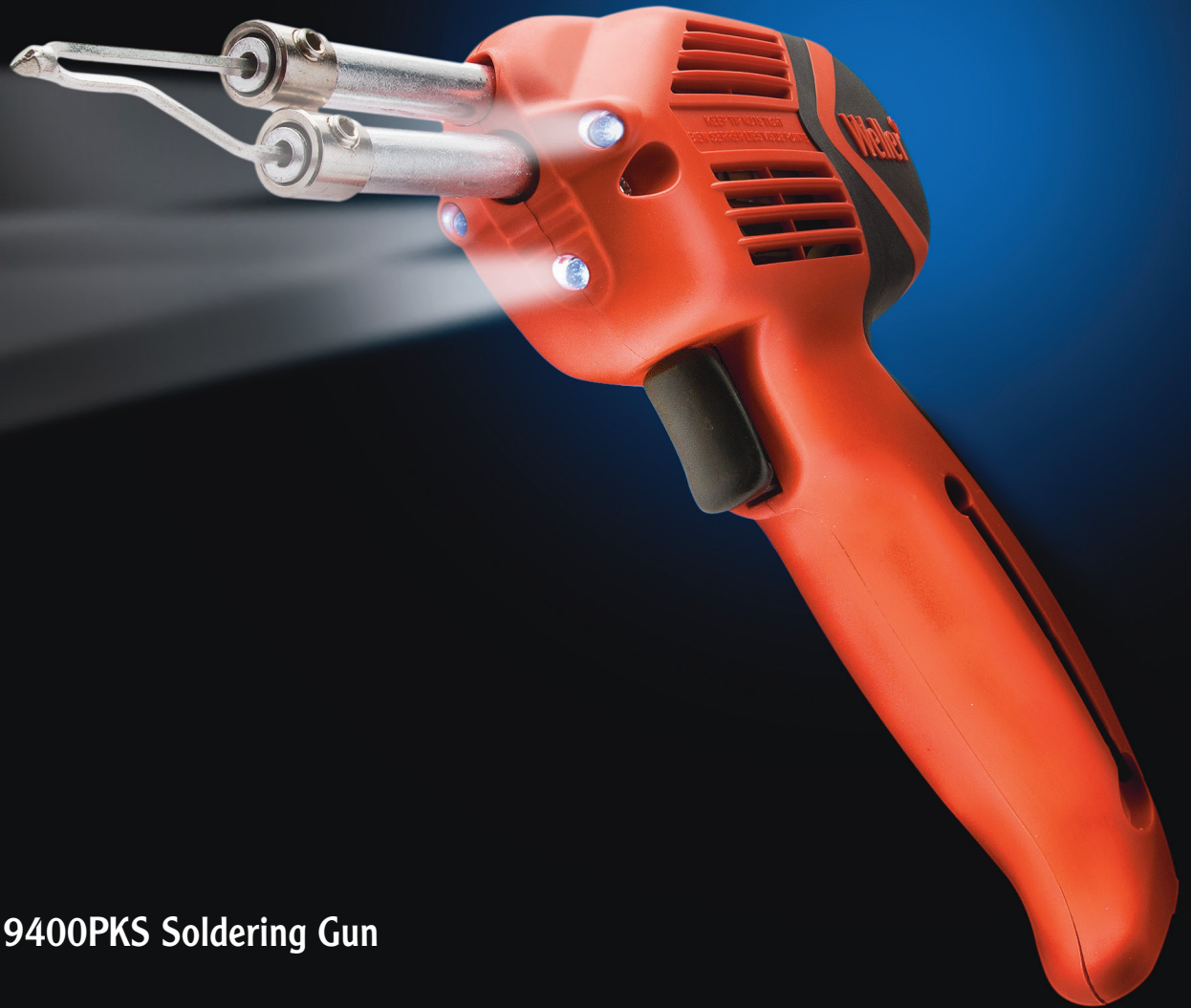
9400PKS Soldering Gun

Shadow-free LEDs help you take aim on your most ambitious DIY projects