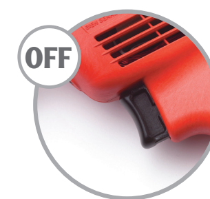
Trigger released: Power off