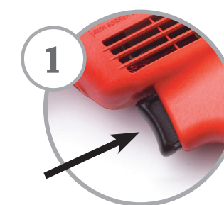
Trigger pulled halfway: 140 W power