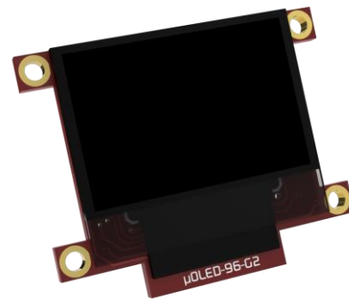
The uOLED-96-G2 Display Module

NOTE (*): Arduino remains the property of the Arduino Team. All references to the word Arduino and Arduino Hardware are licensed under the Creative Commons Attribution Share-Alike license.