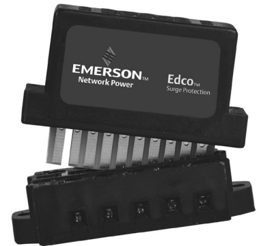
EDCO PCB1B-WKEY BASE SOLD SEPARATELY

Seulement le personnel qualifié doit installer ou maintenir ce système. Des précautions de sécurité en électricité doivent être suivies lors de l'installation ou de la maintenance de cet équipement. Pour éviter tout risque de choc électrique, débranchez et verrouillez toutes les sources d'alimentation de cet équipement avant de.