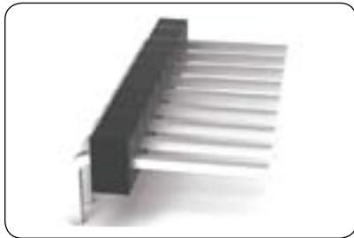
Right Angle / Breakaway Header**