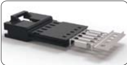
IDC AMPMODU MTE