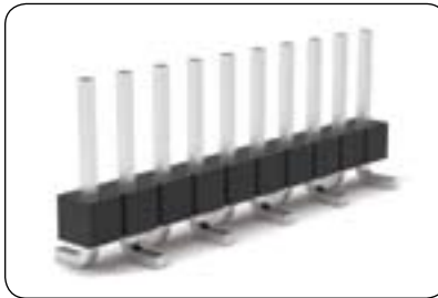
Surface Mount / Breakaway Header**