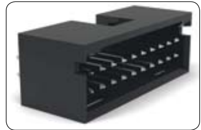
Vertical / Shrouded Header