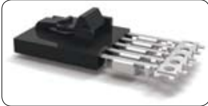
IDC AMPMODU MTE