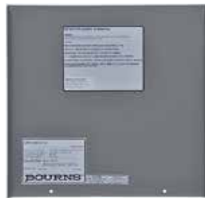
Inside Front Panel