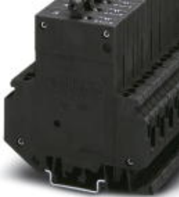
Thermomagnetic circuit breaker, 1-pos., fast blow, 1 N/O contact, with universal foot for mounting on NS 32 or NS 35

Please be informed that the data shown in this PDF Document is generated from our Online Catalog. Please find the complete data in the user's documentation. Our General Terms of Use for Downloads are valid ( http://download.phoenixcontact.com )