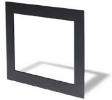
Optional Industrial Flange Bezel (Part Number: 5021104)