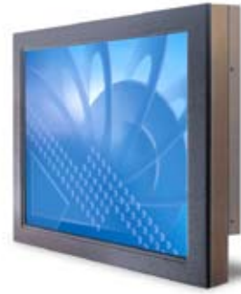
With optional Slimline Bezel (Part Number: 2709122)