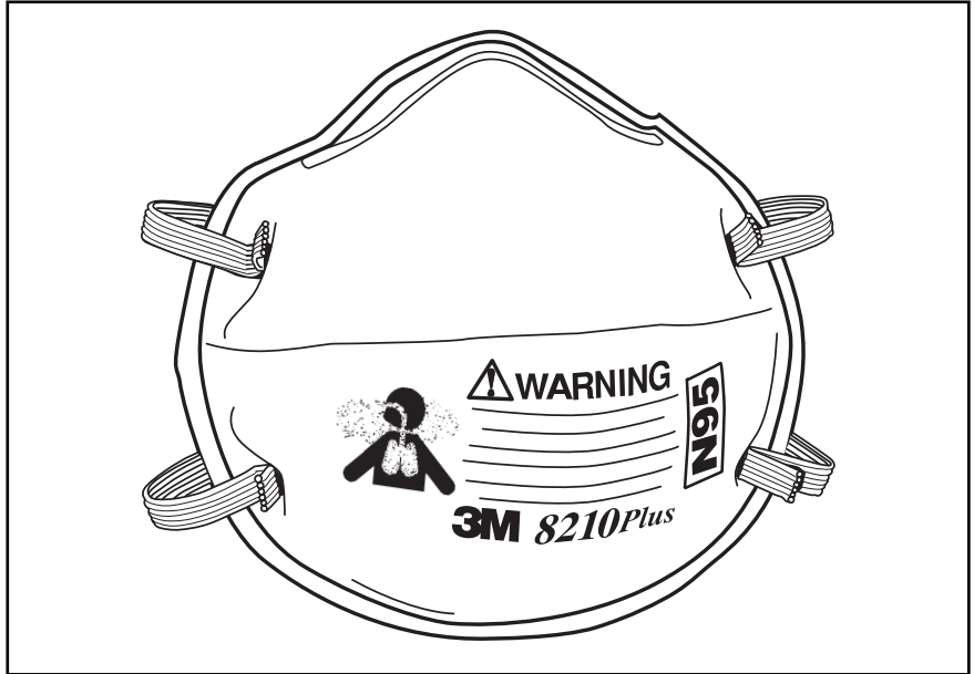
3M™ Particulate Respirator 8210Plus, N95

3M's disposable respirators are designed to help provide quality, reliable worker protection that meets the varied needs of our customers who rely on consistent product performance and service. 3M's proprietary filter media and superior product construction help provide greater worker comfort which can help increase productivity.