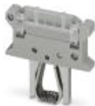
Isolating connector, for using the base fuse terminal block as plug disconnect terminal block