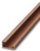
G-profile DIN rail, material: Copper, unperforated, height 15 mm, width 32 mm, length 2 m

DIN rail - NS 32 CU/35QMM UNPERF 2000MM - 1201358