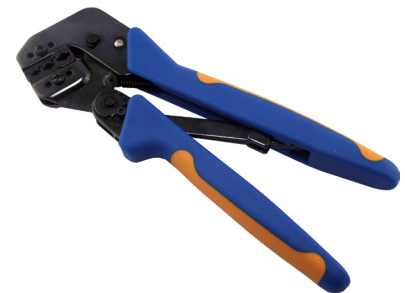
58433-3 - Pro-Crimper Commercial Hand Tool