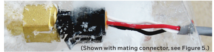
Figure 2. PX3 Series External Freeze/Thaw Resistance