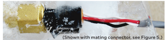
Figure 2. PX3 Series External Freeze/Thaw Resistance