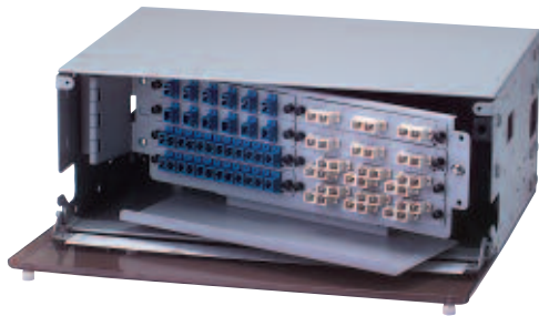
AX100115 FiberExpress (4U) Rack Mount Patch Panel