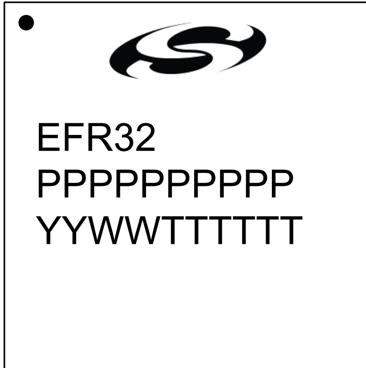
Figure 9.3. QFN68 Package Marking