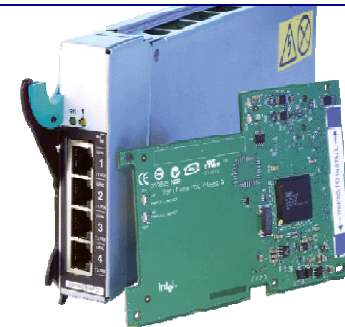
Adapter card pictured not included