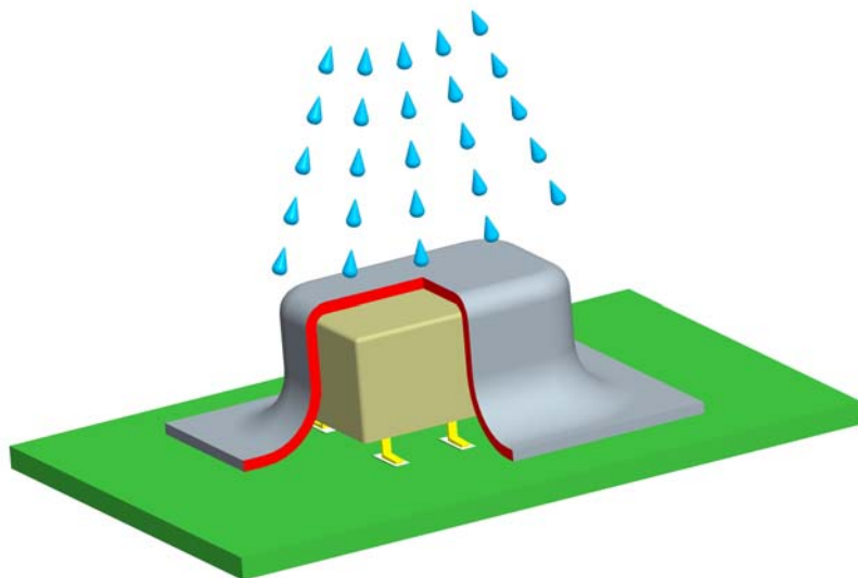
Fig. 4: Coating of relays on PCB's

Suitable are Epoxy, Urethane and Fluorine coatings. Absolutely forbidden are Silicone coatings.