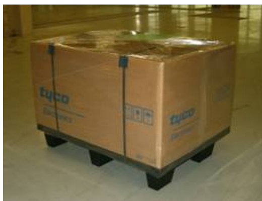
Fig. 1: Proper packing of relays for transportation

In transit, care has to be taken to avoid excessive shock and vibration. Mechanical stress can lead to changes in operating characteristics or to internal damage of the relay (see vibration and shock resistance). If mechanical stress is suspected, the relay should be checked and tested before use. Whenever relays arrive in damaged boxes at customer sides, there is a potential risk of transportation damage.