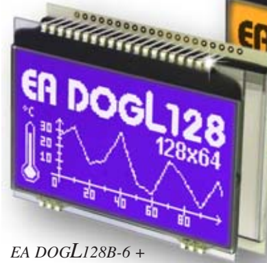
EA DOGL128B-6 + EA LED68x51-W