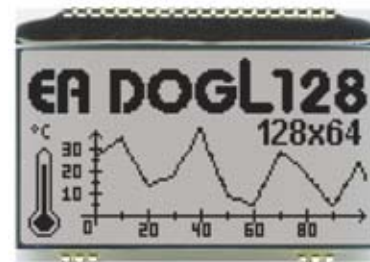
Orientation for 6 o'clock (Bottom View)

*) Make sure that for 6:00 viewing direction ADC has to be set to „reverse“ (mirrored layout) !