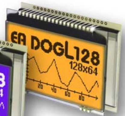
EA DOGL128W-6 + EA LED68x51-A