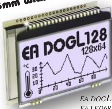
EA DOGL128W-6 + EA LED68x51-W

also available in low quantities ! flat: 6.5mm with LED B/L mounted