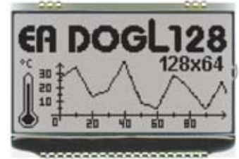
Orientation for 12 o'clock (Top View)

If the display is read mostly from above (on the front of a laboratory power supply unit, for example), the preferred angle of viewing can be set to 12 o'clock. This rotates the display by 180°. A slightly different initialization setup is required for this. Also keep in mind that the leftmost column (normally numbered as 0) will now change to 4.