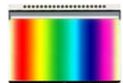
EA LED68x51-RGB Full Color

http://www.lcd-module.de/eng/pdf/grafik/dogl128-6e.pdf