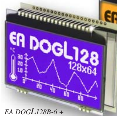
EA DOGL128B-6 + EA LED68x51-W