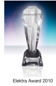
Elektra Award 2010