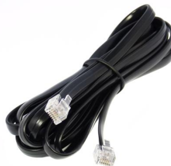
WX connection cable Order No. 0058764710