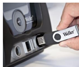
Multi-purpose USB port