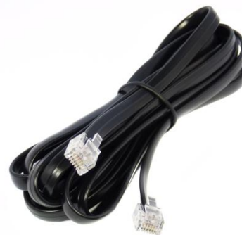
WX connection cable Order No. 0058764710