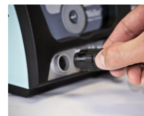
WX tool connection