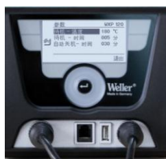
Multiple language menu navigation