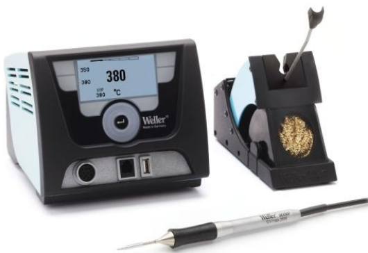
WX 1 control unit with WXMP Micro soldering pencil (40W / 12V) and WDH 50 safety rest