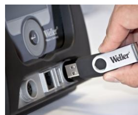
Multi-purpose USB port