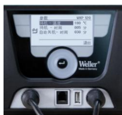
Multiple language menu navigation