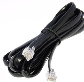
WX connection cable Order No. 0058764710