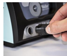
WX tool connection