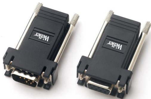
WX Adapter for PC Order No. 0058764711

Order No. 0052920999 (0052920899 for pencil only)