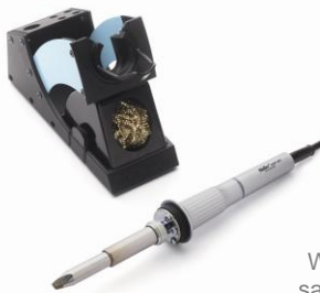
WXP 200 set with safety rest WDH 31

Order No. 0052920299 (0052920199 for pencil only)