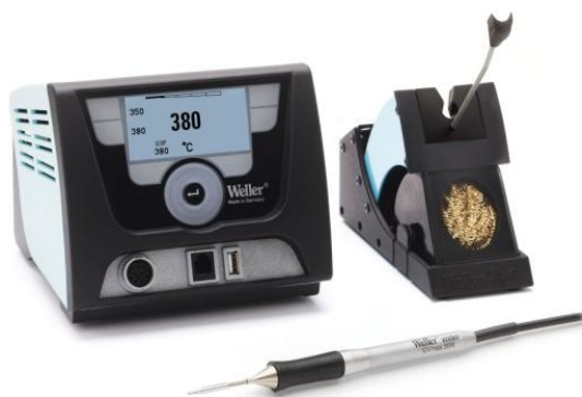
WX 1 control unit with WXMP Micro soldering pencil (40W / 12V) and WDH 50 safety rest