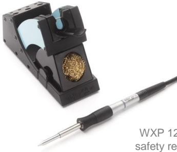
WXP 120 set with safety rest WDH 10