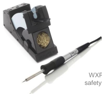
WXP 65 set with safety rest WDH 10