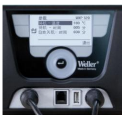
Multiple language menu navigation