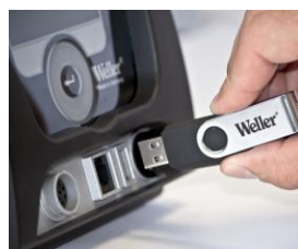
Multi-purpose USB port