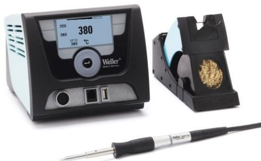
WX 1 control unit with WXP 120 (120 W / 24 V) soldering pencil and WDH 10 safety rest