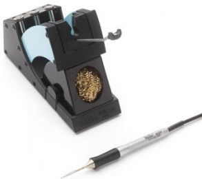
WXMP set with safety rest WDH 50

Order No. 0052920699 (0052920599 for pencil only)