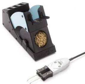
WXMT set with safety rest WDH 60

Order No. 0052920499 (0052920399 for pencil socket only)